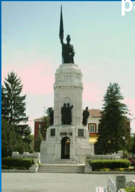
➤ "Mother Bulgaria"

Two of the most popular and most attacked with acts of vandalism monuments situated in the city center, in nice surroundings and equipped with panoramic illumination